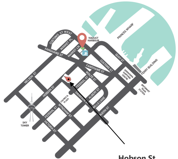
Hobson St Campus