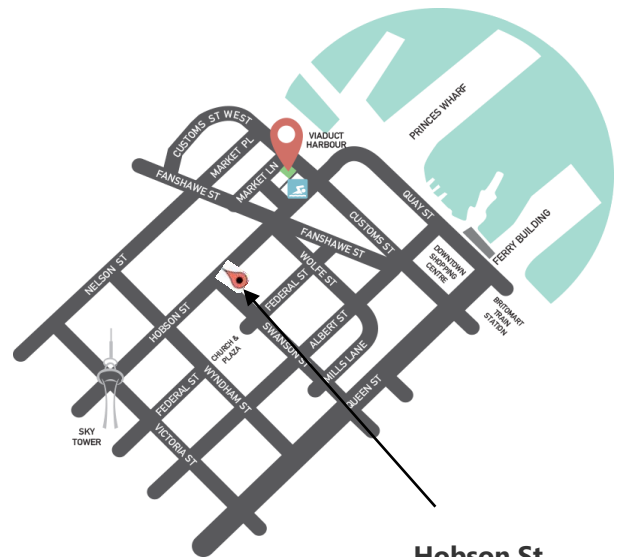
Hobson St Campus