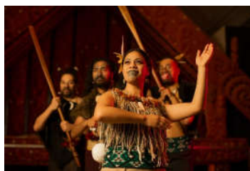
Maori show & Museum