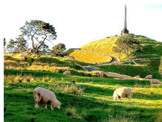
One Tree Hill