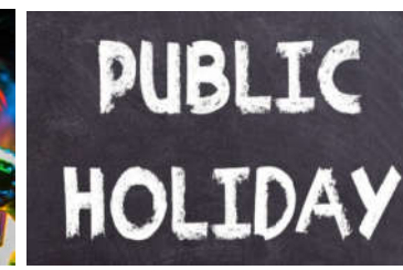
Public Holiday (Matariki)