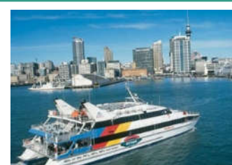
Ferry to Devonport