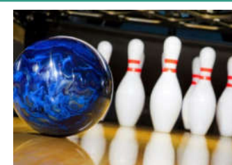
Ten Pin Bowling