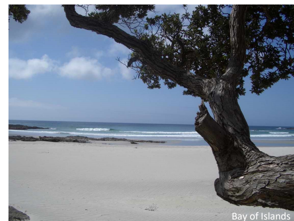
Bay of Islands

Rangitoto Island, the most noticeable feature of Auckland's inner harbour, pushed its way through the ocean floor around 600 years ago. The volcanic fireworks that accompanied it inspired local Maori tribes to call it 'Rangitoto' which in English means 'Sky of Blood'.