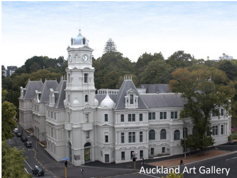
Auckland Art Gallery